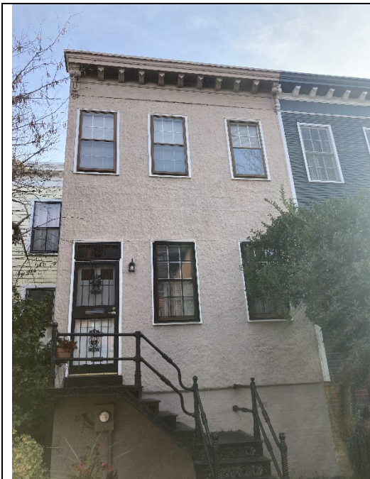
Front elevation: no alterations facing 11 th Street