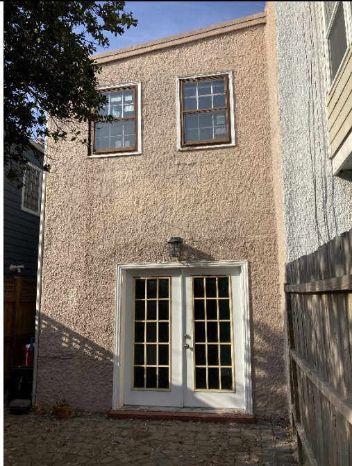
Rear façade to receive proposed addition