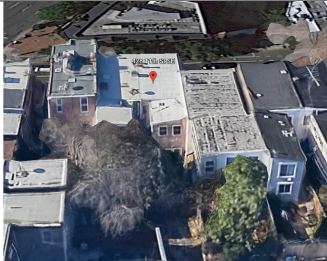
Aerial view with location of available rear yard for proposed addition.