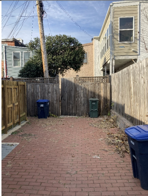
Alley view and adjoining property