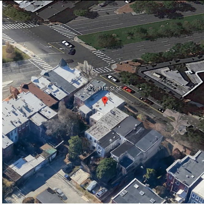
Rear facade and adjoining properties visible at aerial view where addition will be developed